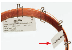
Figure 2: The guard column end of an Integra-Guard column is clearly labeled for easy identification.