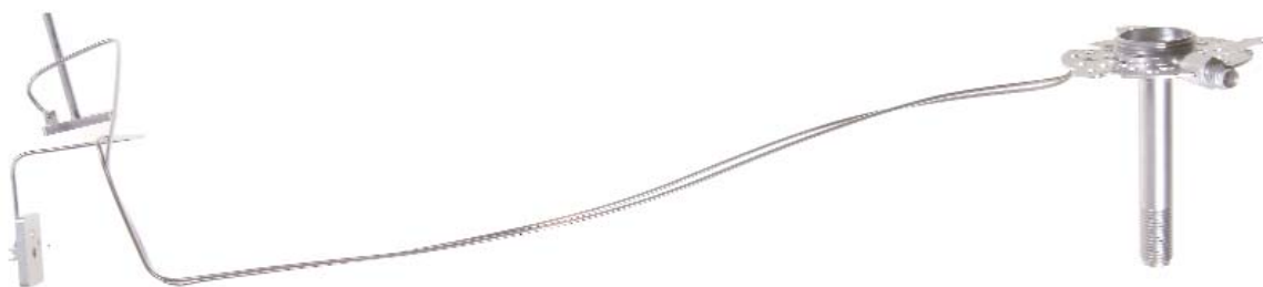
EZ Twist Top™ Shell Weldment for Agilent 7890 GCs

Call Technical Service at 800-356-1688 or 814-353-1300, ext. 4 (or your Restek representative) if you have any questions about this product or any other Restek product.