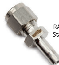
RAVE+ Guard: Stainless Steel