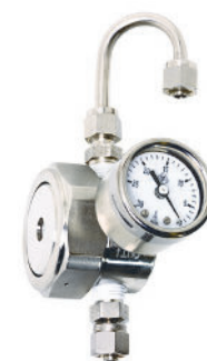
Miniature Air Sampling Kit