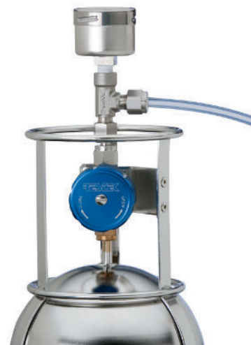
Figure 3 Sampler installed on a canister