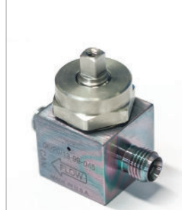
Figure 7: Bonnet nut/stem assembly installed in valve.