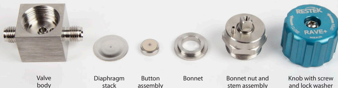
Figure 1: A disassembled RAVE+ diaphragm valve.

Each kit contains one preassembled stack of three diaphragms, one button assembly (button and button retainer), and one tube of lubricating grease. Valves and other components are not included.