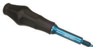
2-in-1 Filter/O-Ring Insertion Tool Handle

Inserting an O-Ring (ASE 100/150/200/300/350 systems), using 2-in-1 Filter/O-Ring Insertion Tool Handle.