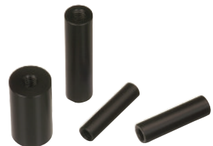
Filter Insertion Attachments

Press the tool firmly inside the cap until the O-ring snaps into place.