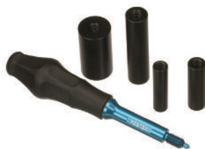
2-in-1 Filter/O-Ring Insertion Tool Kit

Push the filter to the bottom of the extraction cell.